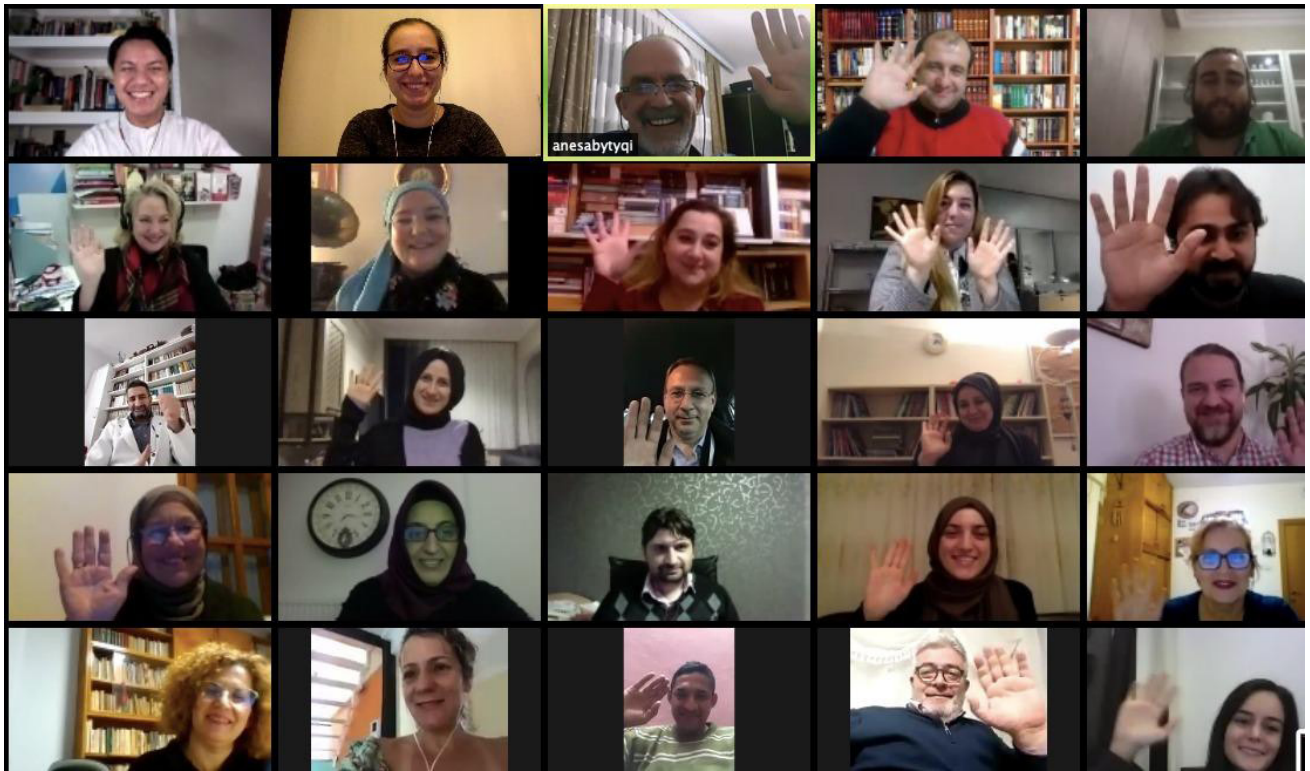
The Closing Meeting