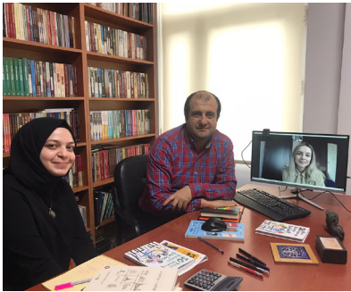
The photos from online B2B meetings